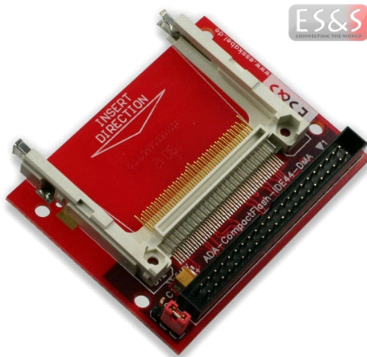
Compactflash to IDE44 Adapter (long socket version)