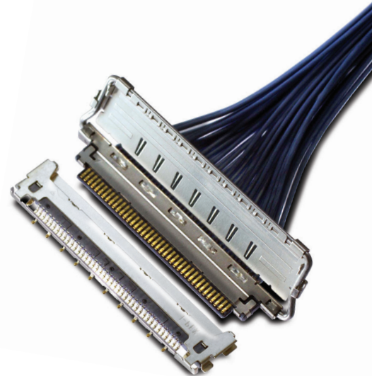
The CABLINE® CA-II Micro-Coaxial Wire-to-Board Connector has full 360-degree EMI shielding allowing for greater flexibility in placement on the board.

For more information and to help determine which I-PEX Connector is compatible with your system's needs, contact your I-PEX Connectors representative or visit I-PEX Connectors online at www.i-pex.com .